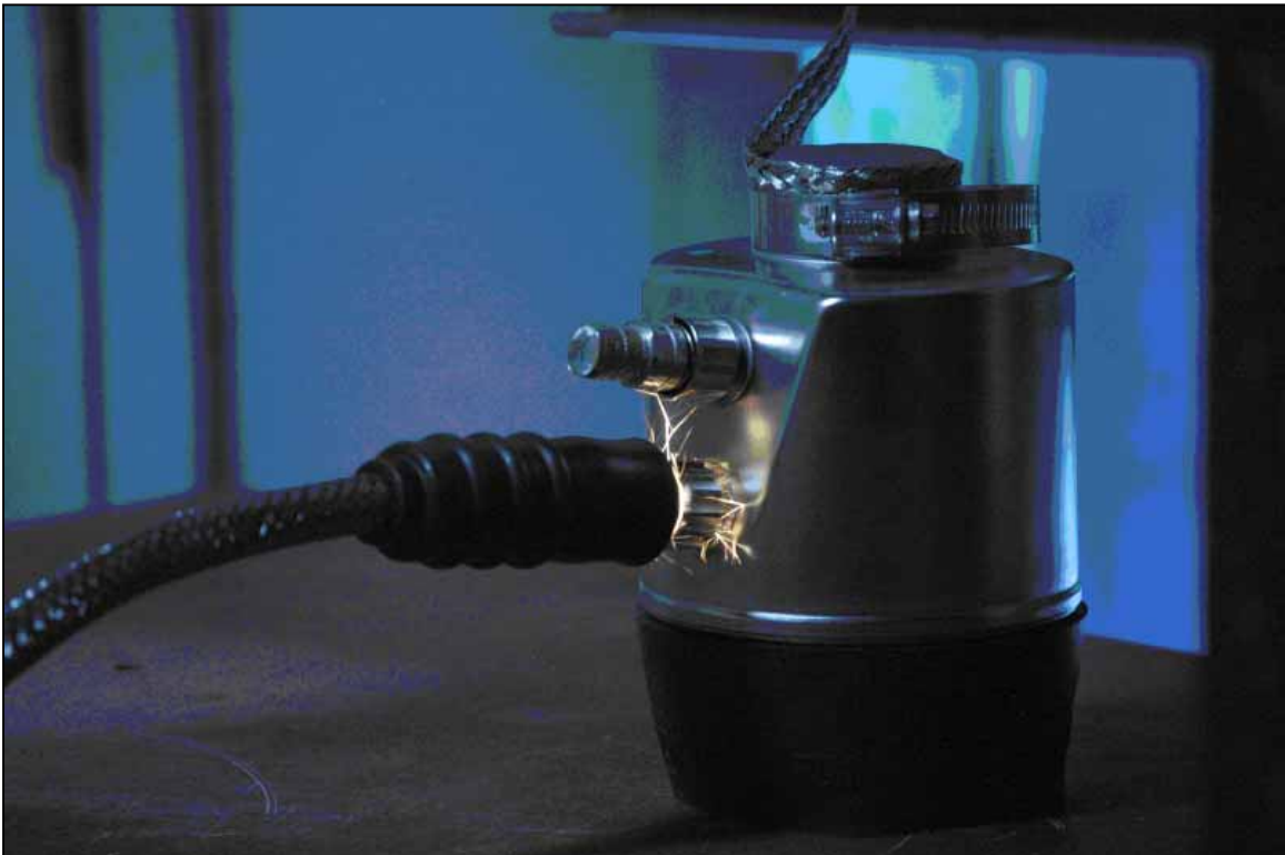
Figure 1 – Test Area Setup

The surge current Component D waveform as defined in SAE ARP5412 had a time to crest of 13 \mu s and tail time (return to 50% of crest) of 32 \mu s. Figure 2 is a typical current pulse oscillogram. The applied currents started at 7 kA and increased in \sim 5 kA steps until a failure occurred.